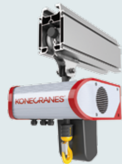
Enclosed XM Steel Track