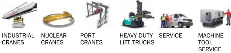
INDUSTRIAL CRANES NUCLEAR CRANES PORT CRANES HEAVY-DUTY LIFT TRUCKS SERVICE MACHINE TOOL SERVICE