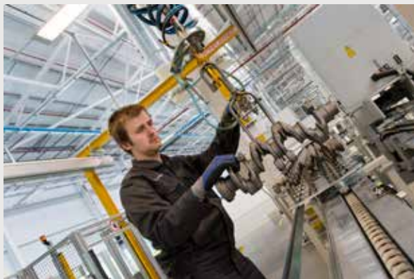
▶ Deployed throughout the JLR EMC machine hall are ergonomic, ATB pneumatic air balancers that interface with a variety of grippers. Using air pressure as the ATB's power source, heavier components such as engine blocks, cylinder heads and crankshafts appear almost weightless.