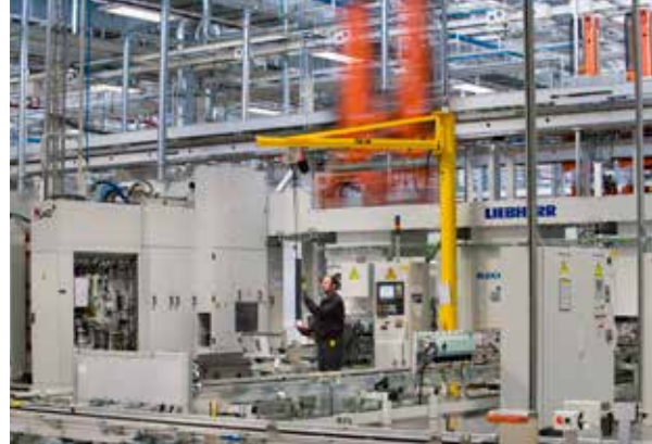
▲ Some 70 Konecranes XMP pillar jib cranes equipped with the popular and versatile CLX electric chain hoist are featured across the JLR site, providing a maximum lifting capacity of 250kg.

Anyone seeking further information relating to Konecranes' lifting solutions should contact Freephone 0808 2929256, or visit the website at: www.konecranes.co.uk